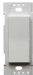
Gang Mount Battery GM-B